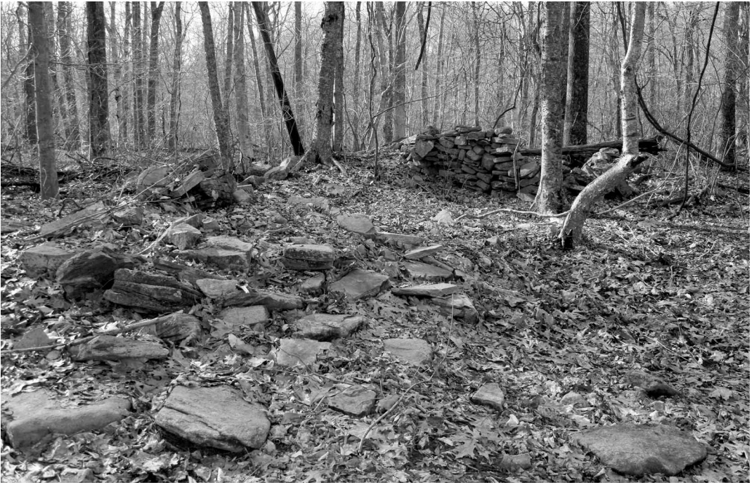
Figure 3. View of Site 102–123, excavated in 2005 and 2006. The rock pile in the foreground is the collapsed chimney stack for a framed house, and the slight depression to the right is the filled-in cellar that sat beneath that house. The stacked rocks in the background compose the small stone-wall enclosure that may have served as the base for a granary.

some nailed elements and at least one glass window pane or, alternatively, a small wooden framed structure with no foundation, no cellar or crawl-space, and no chimney. Excavation revealed three pits of varying size within a space of no more than 30 m 2 that contained a variety of domestic debris. Ceramic vessels and wares included basic redware, Astbury-type ware, Staffordshire slipware, white salt-glazed stoneware, and Brown Reserve porcelain (Silliman and Witt 2009). Iron kettle fragments and a hook were also recovered, as were a musket ball, numerous straight pins, glass beads, and white ball clay pipe fragments. Some glass bottle fragments were present, but not in great numbers. Architectural materials included forged iron nails, a small quantity of window glass, and some post-holes. Food remains include domestic livestock, fish, shellfish, and other foods (Fedore 2008).