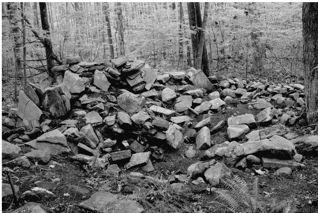
Figure 4. View of Site 102–113, excavated in 2004. The large rock pile represents a collapsed chimney stack, and the concavity framed and partially filled by these rocks represents the crawlspace that once existed beneath the house. The trash pit noted in the text was found just outside the photograph frame on the left.

metal artifacts were recovered as well, including forks, knives, buckles, finger rings, a key, and several buttons (see Patton 2007). One stone projectile point fragment of indeterminate date, a handful of chert/flint flakes, and two unambiguous pieces of worked window glass represent the lithic technologies used by site residents. Faunal remains reveal the presence of livestock (such as cattle and pigs), the use of marine resources (such as clams, mussels, oysters, and fish), and small numbers of other local fauna (Fedore 2008).