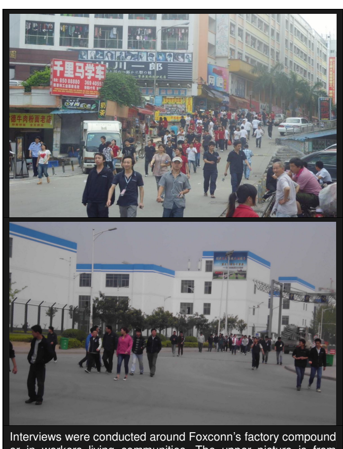
Interviews were conducted around Foxconn's factory compound or in workers living communities. The upper picture is from Guanlan, Shenzhen and the lower picture is from Processing Zone of Zhengzhou.

In February and March 2012, the FLA conducted factory inspections and a worker survey at Foxconn's production sites in Shenzhen and Chengdu. An investigative report was published in late March 2012. The FLA's report highlighted