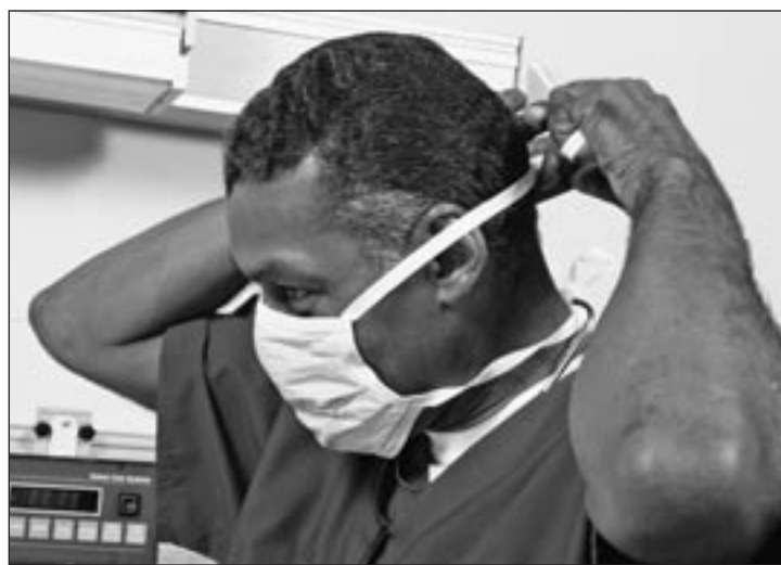
Physicians decide whether a proposed intervention can or cannot achieve a clinical or patient/family goal.

For example, although the insertion of a feeding tube for a patient in a permanent vegetative state would feed and hydrate