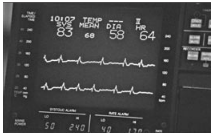
Interventions may produce a medical effect for the patient but not a medical benefit.

The benefit of a treatment is the affect of that treatment on the whole person (i.e., the existential human person as a composite of his or her