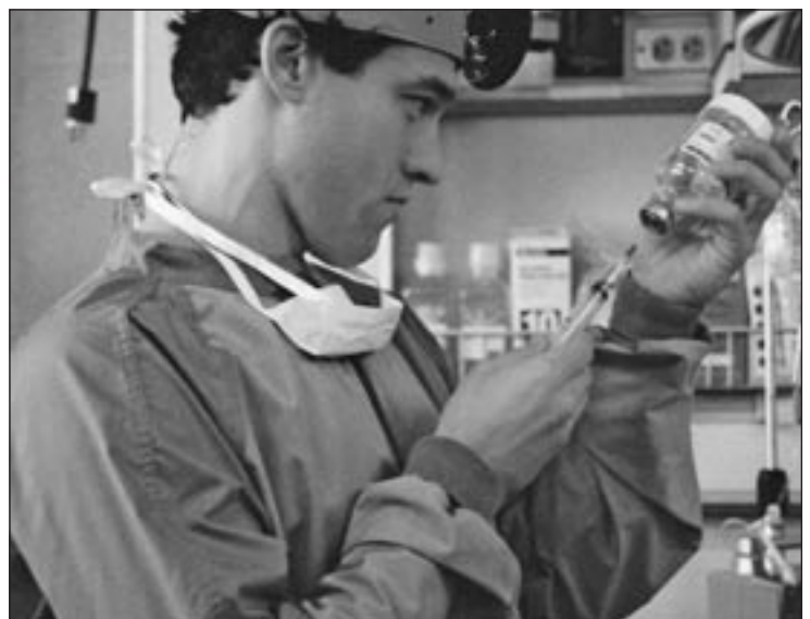
Control of a patient’s pain and suffering is never futile.