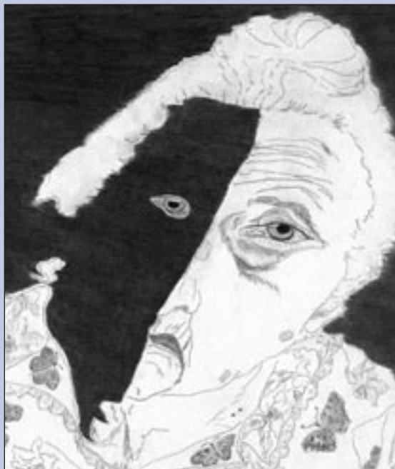
Futility decisions will include clinical facts and the patient’s values.

All of this means physicians must know the patient as well as today’s circumstances of medical care allow. Physicians must also make known to family and the health-care team what they will, or will not do according to their norms of professional and moral integrity. Families and patients will then