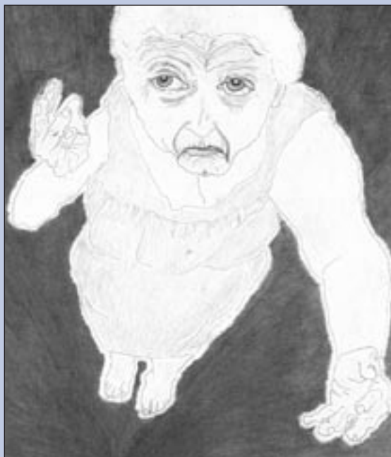
Futility involves the weighing of three factors: effectiveness, benefits, and burdens.

It would be a gross abuse to devalue the lives of certain patients — like those in permanent vegetative states; the disabled or handicapped, especially infants; the very old; or those on the margins of society. Nor should futility be defined in terms of the values and kinds of life physicians or other health professionals deem worthy of living. In addition, futility cannot be used as the criterion for taking organs for donation.